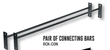
PAIR OF CONNECTING BARS RCK-CON