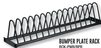
BUMPER PLATE RACK RCK-PWR/BPR